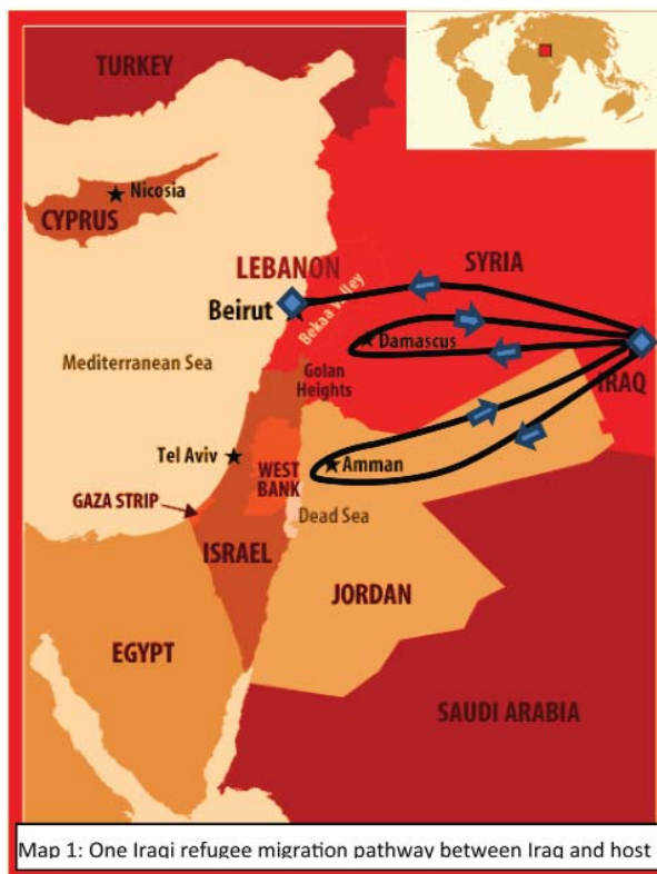
Map 1: One Iraqi refugee migration pathway between Iraq and host

As I was a university student, then I was a member of the party [ ... ]. Our loyalty is for the country. We started receiving threats. And then we decided to leave, my father and I only. We left without anything. Only with the clothes I was wearing. We felt like we were thieves. I don't know what to say. People were threatening