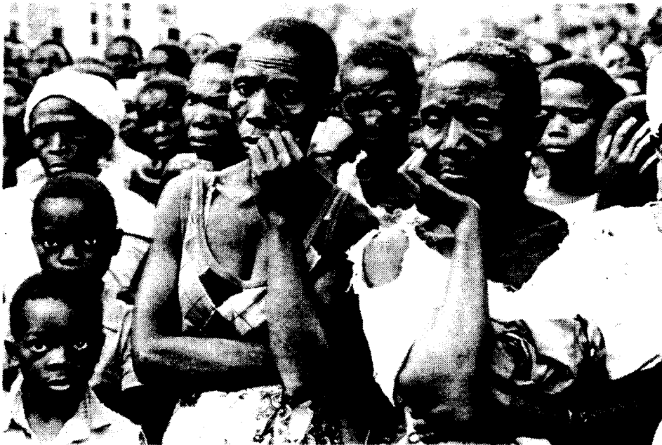
Mozambican "displaced persons" meet to discuss shortages, 1986.

The crisis in Mozambique which has recently captured the world's attention is the result of a number of factors, some of long duration. Mozambique, a country about half again as big as California with a population of about fourteen million and a GNP per capita (1984) of US $210, was left by its Portuguese masters with only US $1 million in foreign reserves and gold, an annual GNP per capita of not much more than US $100 and a population with an illiteracy rate approaching 98% and largely unskilled. All but 15,000 colonialists fled, many to South Africa, and in their bitterness they destroyed and paralyzed machinery. As they left they often simply removed a vital mechanical part; other times they destroyed repair manuals and business records in an effort to sabotage the Mozambican economy.