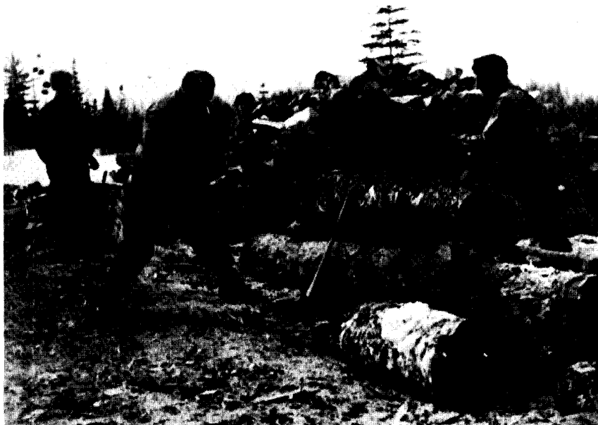
"They were seen as people with brains in a country that wanted people with brawn." Jewish internees chopping wood at Camp B, near Fredericton, New Brunswick.